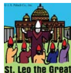
St. Leo the Great