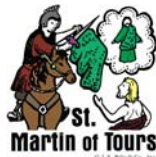
St. Martin of Tours